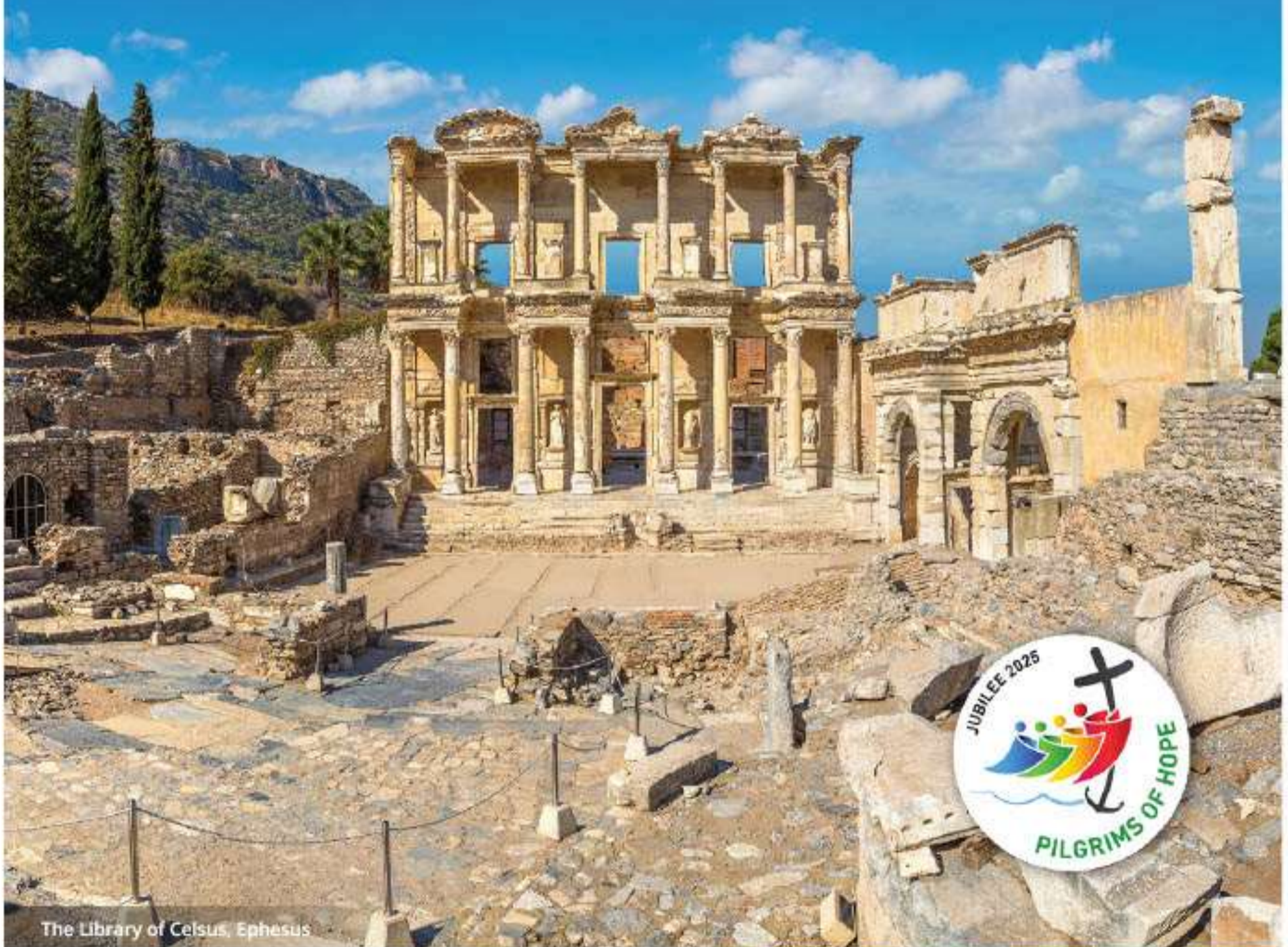
The Library of Celsus, Ephesus