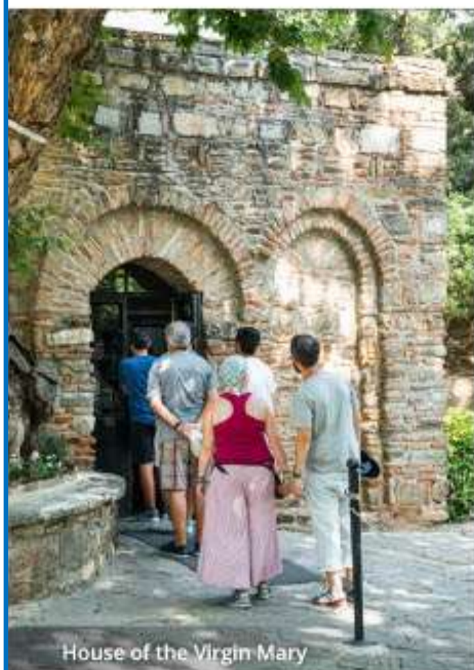
House of the Virgin Mary